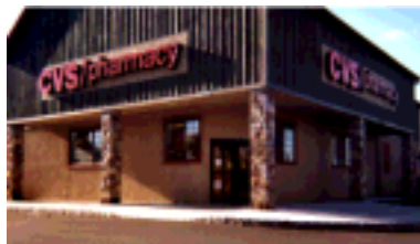
Photo of a CVS in Doylestown with a “unique” design. Note the lack of village scale and character.

FLP’s vision would maintain the village-look with multiple buildings in the same architectural scale.